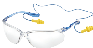
3M™ Tora™ CCS Safety Spectacles

PC = Polycarbonate AS = Anti-scratch AF = Anti-fog